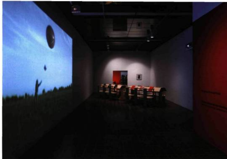
Reading Room for the Working Artist installation at Galerie VOX image contemporaine, Montreal, 2006

Moving beyond the projection, we entered a space in which there was a reconstruction of the reading table and chairs from Aleksander Rodchenko's Worker's Club , which he designed for the International Exposition of Modern Decorative and Industrial Arts, held in Paris in 1925. Around it were arrayed twelve heady and fully packed tomes on art, literature, and philosophy for our perusal. In the second room, there was a display case of relatable artworks from the 1920s, a reconstruction of Rodchenko's chess table – also part of the Worker's Club – and some of the artist's signature photo-works. Two upstairs spaces contained more of these works. Grauerholz said that the image of the chess table is symbolic for the relationship between the viewer and the artist, the archivist and those perusing her archive. We were enjoined to sit and move the first white pawn.