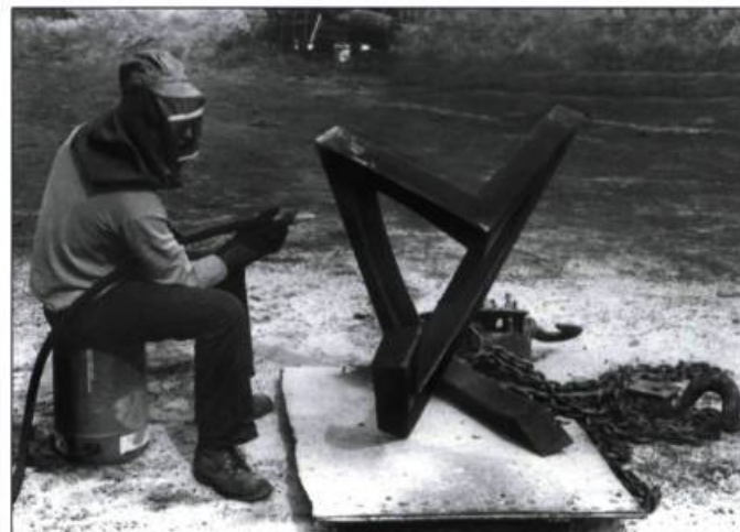
© Claude Millette. L'artiste et Trajectoire n°1 , 1980 (sculpture en cours de réalisation). Collection de Pierre-Paul Sylvestre

Claude Millette | 20.05.2006 – 02.07.2006_ La résistance des matériaux Sélection d'œuvres, de 1976 à 2006 Commissaire : Mélanie Boucher Vernissage 20 mai – 15 h Conférence 31 mai – 19 h