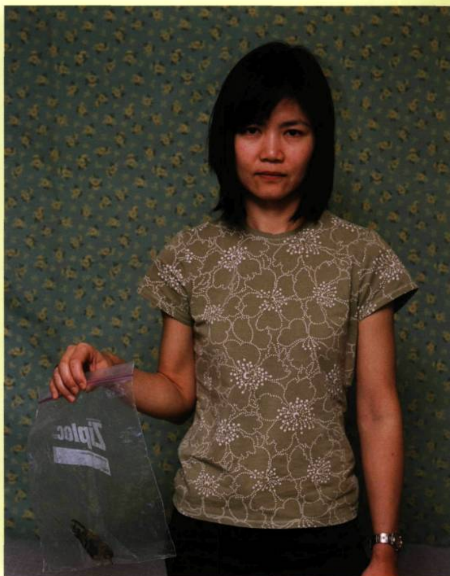
The Centre of the Forest Is a Lake Like Mirror Series of 48 photographs 40 x 32 cm, 32 x 40 cm, 30 x 24 cm and 40 x 40 cm Inkjet prints on paper 2004–2005