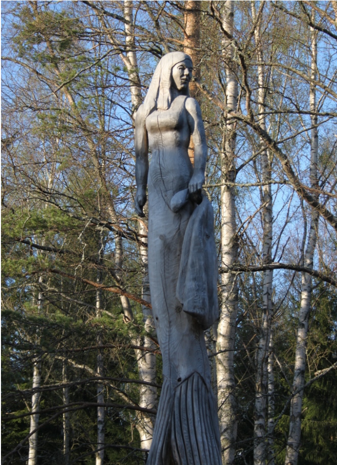
Figure 4. Maiden , wood sculpture by Sandis Kondrats in the sculpture park near the DX station. 2015