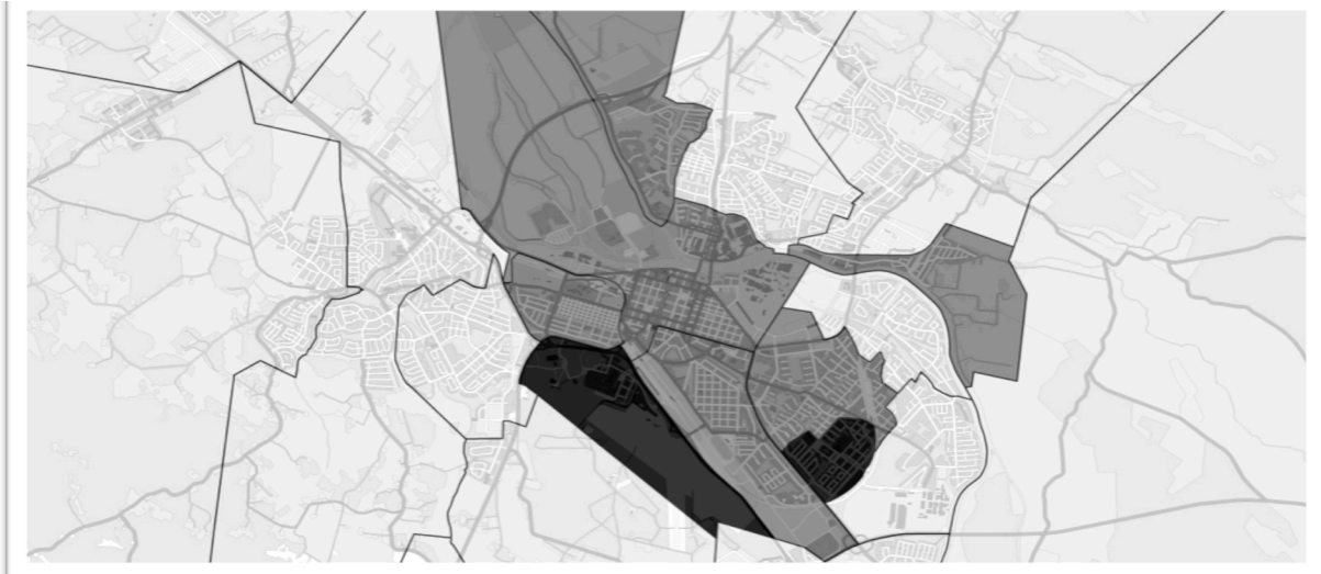
Figure 1. Map of City of Pori, percentage of retired residents

The map shows postal code areas coloured according to the proportion of retirees of each area's population. In the east of the map, Sampola (shaded in black) is distinguished by a high proportion of retirees. The other black area in the south is the location of the county hospital and large nursing home institutions. In the black-shaded areas, over 40% of the population's main occupational status is retired. In the grey-shaded areas 25-40% of the population is retired. In white-coloured areas, less than 20% of the population is retired. The map has been constructed with ArcMap by merging statistical information with a geographical map layer. © City of Pori, Land Survey 2014, permit number 431. Helsinki: Statistics Finland [referred 7.9.2015]. Accessed from: www.tilastokeskus.fi/tup/paavo/index.html . Source: Wallin (2015b)