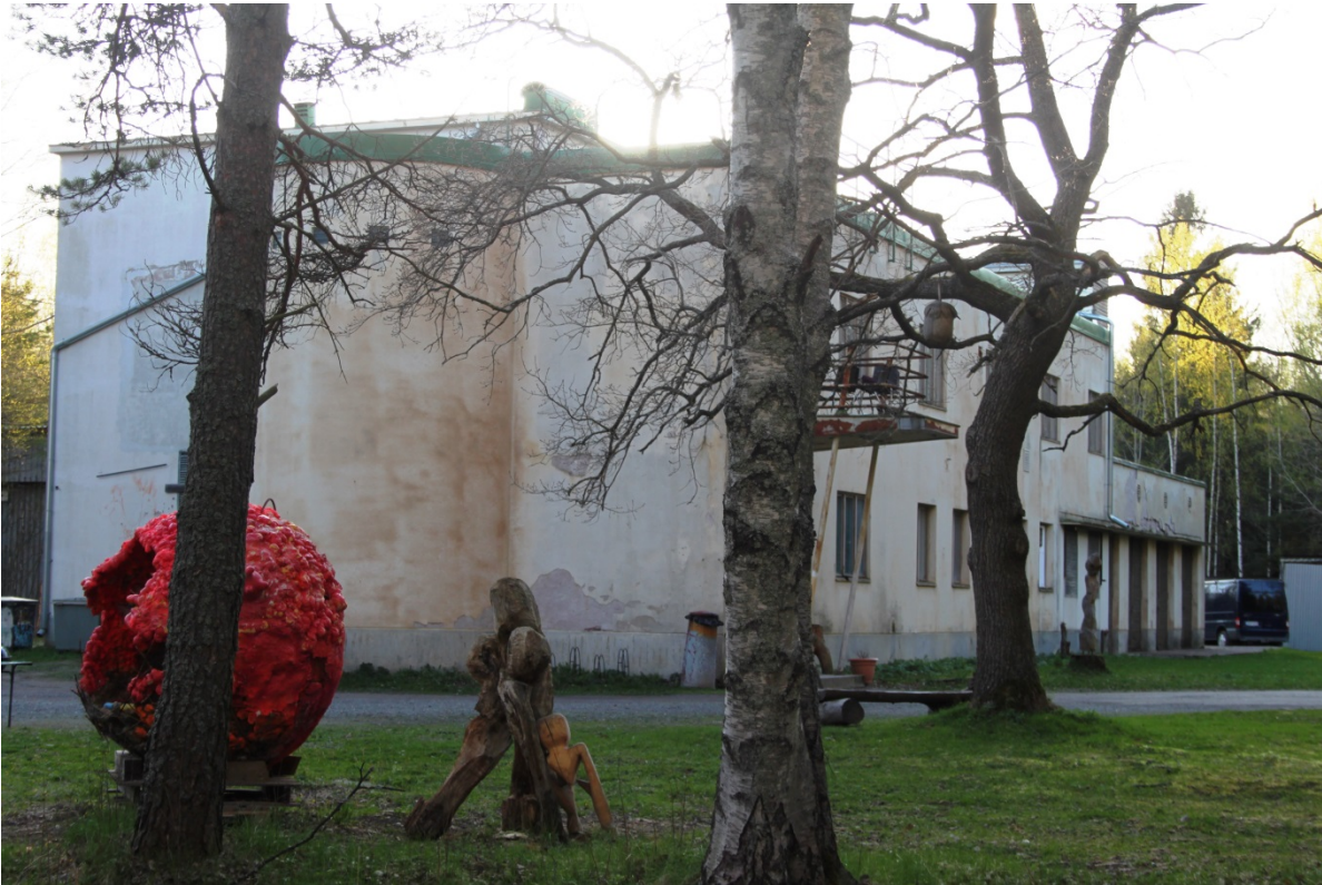
Figure 3. Old disused DX station from 1940, now working space for artist group T.E.H.D.A.S.

The only professional artists to be found in the area were the T.E.H.D.A.S. ('Factory') group, founded near Pori in Kankaanpää in 2002 and active in the target area since 2011. In a short time, this markedly original and productive group had gained visibility by organizing events, art projects, and artist visits. Their presence in the area was visibly manifested in a 'sculpture park' that a group member had carved out from trunks of felled park trees around the DX station the group uses as its home base (Hovi-Assad 2015). The residents were aware of and expressed curiosity about the artist group, mostly in positive terms. Their presence at the DX station and their attempts to repair it and clear its surroundings were welcomed, as the building had been long abandoned and the park area around it had become overgrown.