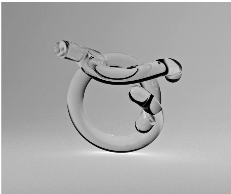
FIGURE 6 A character from Inference 's machine alphabet, from Stefan Maier, Inference , 2021.

computer-controlled light and sound spatialization directed a mobile audience through a complex, non-linear interplay of synthetic language, abstract sound, and fragmentary exposition. The work premiered at the Ultima festival in 2019.