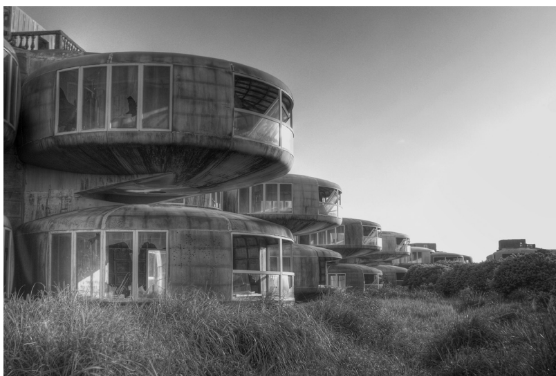
FIGURE 1 Sanzhi Pod City, circa 2008.

Construction of the Sanzhi Pod City, near New Taipei City, Taiwan, began in 1978. Originally planned as a utopian vacation retreat for US soldiers stationed in the South Pacific, the futuristic pod-like structures would never be completed [...] the project was abandoned in 1980. However, when demolition work began some 30 years later, it was discovered that where human construction had ended, not 1, but 5 hitherto unknown species of Orchid Mantises had speciated and multiplied to an estimated population of over 10 million insect inhabitants. Research revealed that the Mantis civilization, which developed inside, between and beneath the Pods, displayed highly unique behaviors [...] The Future [...] is not for us. The Anthropocene, the reframing of the Earth in the image of industrial modernity, will be short lived. It will be less of a geologic era than a geopolitical instant. Humans are already vanishing, even despite our growing aggregate biomass. Our cities are not our own. We are building habitats for other life forms. We are the tools wielded by these other forms. 1