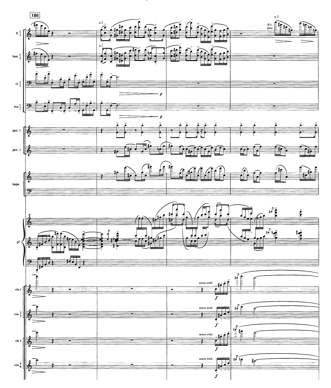
Example 3: Stark, Utter, Forego, movement 2, "Utter", m. 186-189, showing piano drawing its materials from winds' and strings' materials.