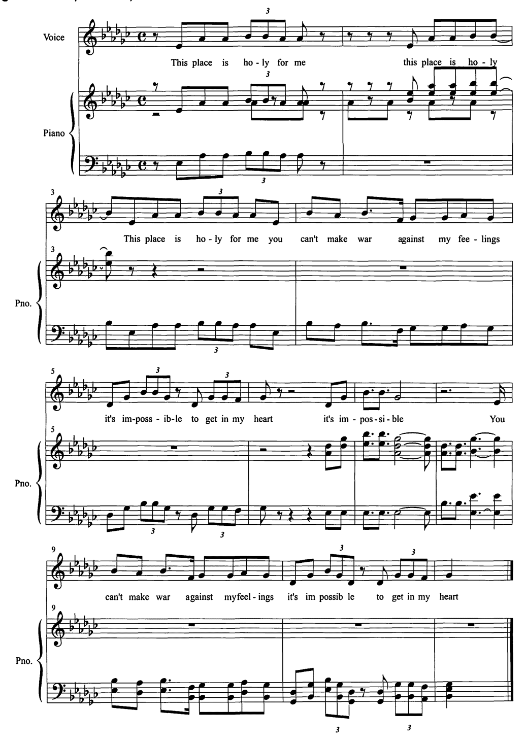
Figure 4: This place is holy for me