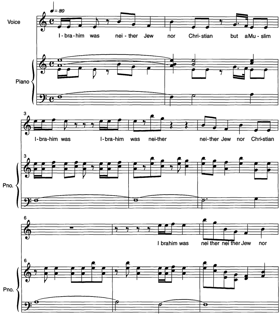
Figure 3: Neither Jew nor Christian

of the melodies often reveal hidden depths of meaning in the spoken text. In what turns out to be one of the most beautiful speech melodies of the second act, a Palestinian man proclaims: "This place is holy for me, you can't make war against my feelings. It's impossible to get in my heart." (figure 4)