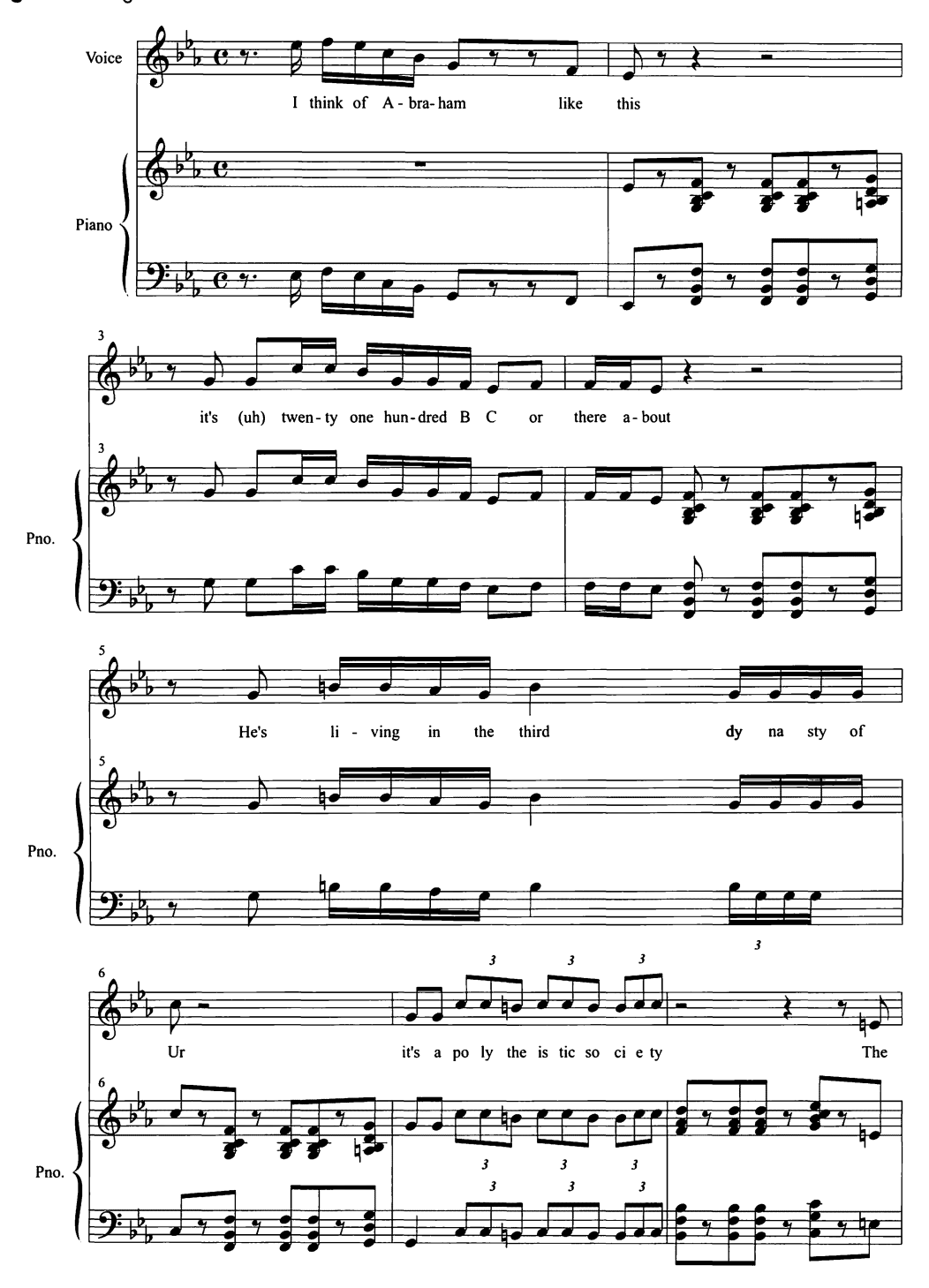
Figure 5 : Sagan "Nana"