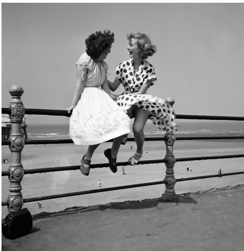
Figure 11. Bert Hardy, Maidens in Waiting , silverprint (July 1951). HU022100 RM © Bert Hardy/Hulton-Deutsch Collection/CORBIS