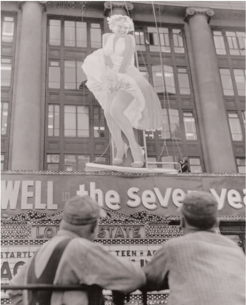
Figure 4. Fifty-Two Foot Figure of Marilyn Monroe Installed at Loew's State Theater, New York (19 May 1955) . U1084468 RM

These images of Marilyn Monroe with her dress billowing around her immediately acquired iconic status and have inspired many adaptations and variations in the fifty years since they were taken.