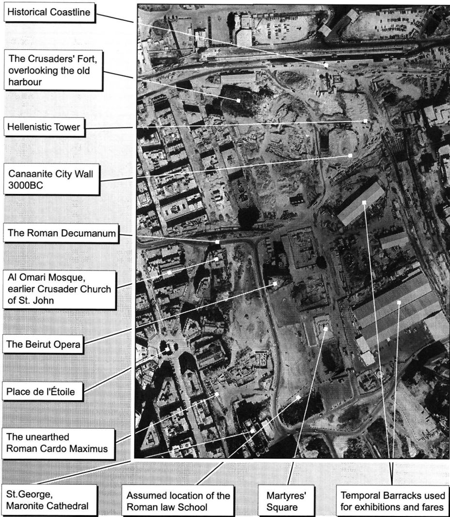
Figure 1 : Aerial photo showing the face of downtown Beirut in 1995

...after demolition had begun. A number of archaeological digs disclosed various layers. The different digs disclose ottoman, byzantine, roman persian, hellenistic, phenician and canaanite layers : a timespan of 5700 years.