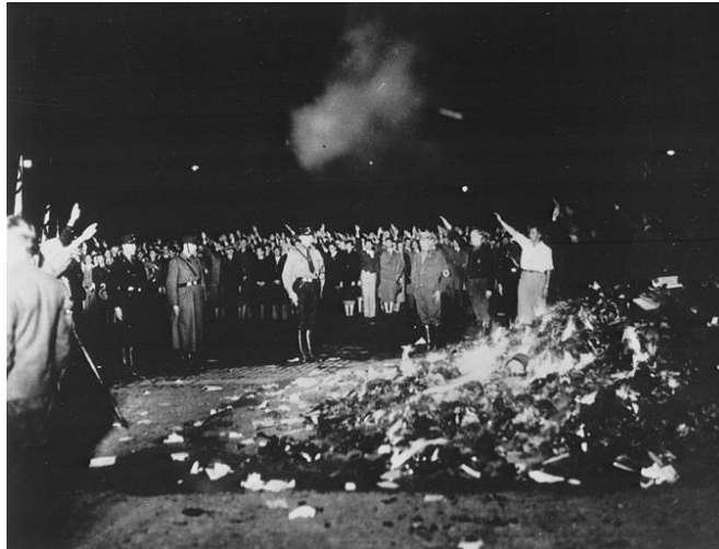
Opernplatz, Berlin book burnings (2)

One chilling scene early on in the story is the town’s collective burning of books in the town square. As the population gleefully threw books into the fire, the town’s Nazi leader boasted how the new Germany would rid itself of the communists and Jews, and their books. After the fire dies down Liesel goes to the smoldering pyre and retrieves one of the books that is still smoking. That becomes the book that propels her into her quest for literally gobbling up books.