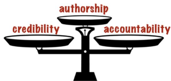
Figure 1. Authorship equation

Researchers should familiarize themselves with proper authorship practices in order to protect their copyrights from research fraud. Moreover, researchers should be aware of the authorship practices within their own disciplines and should always abide by the requirements stipulated by a prospective publishing journal. As some journals require processing and/or publication fees, financial issues should be settled and agreed upon early in the research process to avert subsequent disputes. The Committee on Publication Ethics (COPE) has a guide to help researchers navigate authorship issues (6). Detailed management of authorship disputes is beyond the scope of this article.