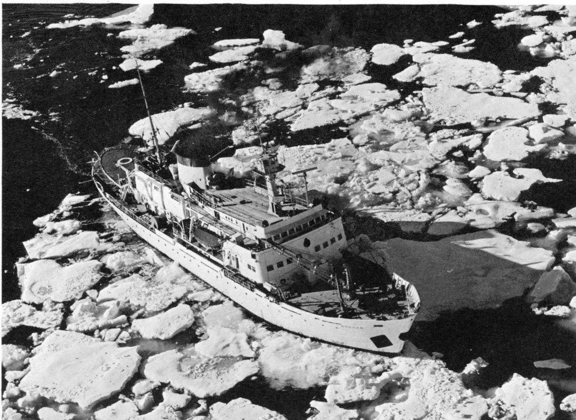
Figure 1 - CCS HUDSON entering the ice pack in the southern Arctic Ocean, Beaufort Sea, in late August of 1970.

Bottom Fauna: Molluscs and other invertebrate shelly animals followed the same distributional pattern of the other marine organisms. Interestingly the small species occurred to the west and the larger to the east, but not many in the area of the Mackenzie River runoff or in deeper waters of the outer continental shelf.