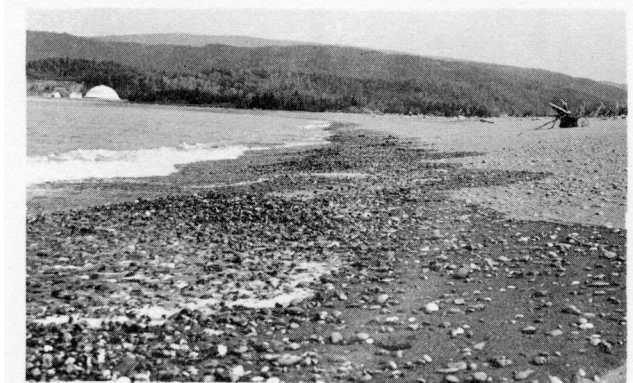
Figure 7 - Long, sandy gravel spit at Riviere Madeleine.

The sweeping of the sediment from the bar surface leaves the tidal bars with a flat, planed-off surface (Fig. 6). During the falling tide, the sides of the newly exposed bar are trimmed and terraced. Sands that are swept from the bar surface and deposited in the deeper pools before the less face of the bar are eroded once more. Small streams draining the bar surfaces during the falling tide erode pebbles and coarse sand and cut small gullies into the bar surface. These depressions are refilled, and the surface of the bar is left planar with the next tidal rise.