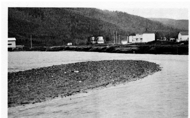
Figure 6 - Planed-off tidal bar emerging at low tide. Silts and sand are swept to the downstream end of the bar nearest the observer.