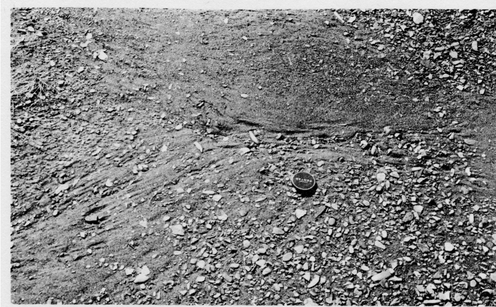
Figure 4 - Sand and silt trapped in a bar depression.

During high tide the tidal bars are submerged. As this is also a period of backup in the river drainage, the velocity and competency of the river are decreased, and sand and gravel are seen to accumulate on the bar surfaces. With a lowering of the tide and an increase in the surface slope and velocity of the rivers, fines deposited on the bar surfaces are largely swept away. Sand trapped beneath or in the lee of large pebbles or cobbles or in sheltered depressions is protected from erosion (Fig. 4). As a result, harrow marks and current crescents are left upon the bar surfaces. A few higher bars which remain above water at high tide display excellent imbrication of large, flat cobbles and pebbles (Fig. 5). These bars are evidently affected by stronger river flows during flood discharges.