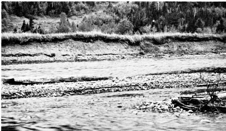
Figure 1 - Bank erosion of Pleistocene gravels and mid-channel bar development. Flow to right.

Where small, steep tributary streams enter the main channels, gravel is accumulated, and mid-channel bars then develop. This indicates that gravel-sized sediment is being supplied to the rivers at the present time. Further evidence on the competency of the rivers is shown in the active bank erosion of the glacial sediments deposited on the valley floors (Fig. 1).