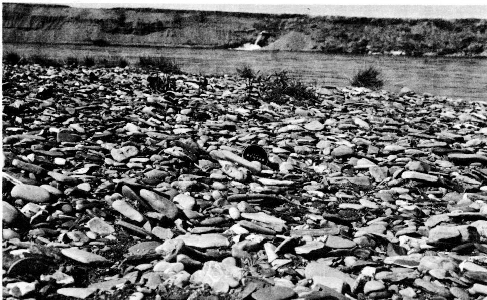
Figure 5 - Imbricated cobbles on a dry bar. The direction of flow across the bar is from right to left.