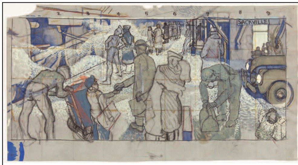
Figure 3: Alex Colville, preparatory drawing for Sackville train station mural (1942).