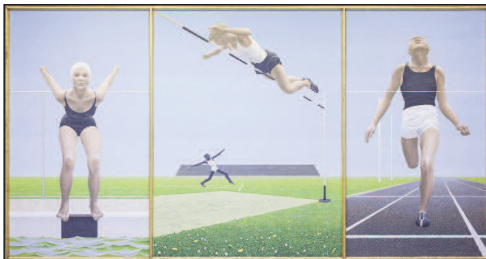
Figure 2: Alex Colville, Athletes (1960), in situ Mount Allison University, Sackville, NB.