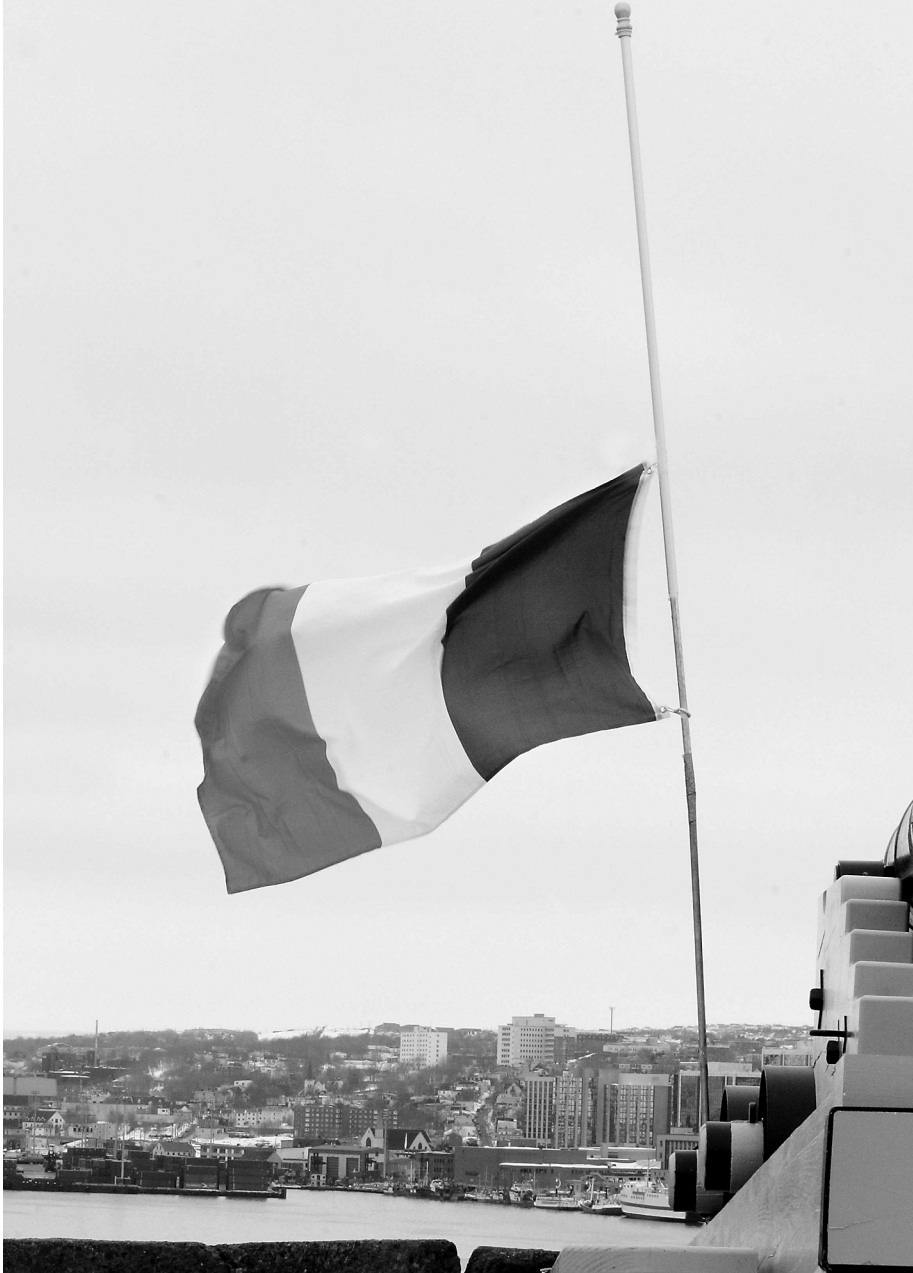
The Pink, White and Green at half-mast on Signal Hill, St. John's, April 2005.