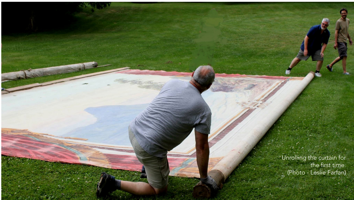
Unrolling the curtain for the first time.

After being measured and photographed by museum staff, the drape was carefully transported to the Colby-Curtis, where it is now stored in a proper climate-controlled environment, and where it begins a new chapter of its life. It is the hope of both the Haskell and the Stanstead Historical Society that a grant can be secured to have this magnificent piece professionally restored. Perhaps in the not-too-distant future, a suitable temporary venue can be found, where it can once again be enjoyed by all.