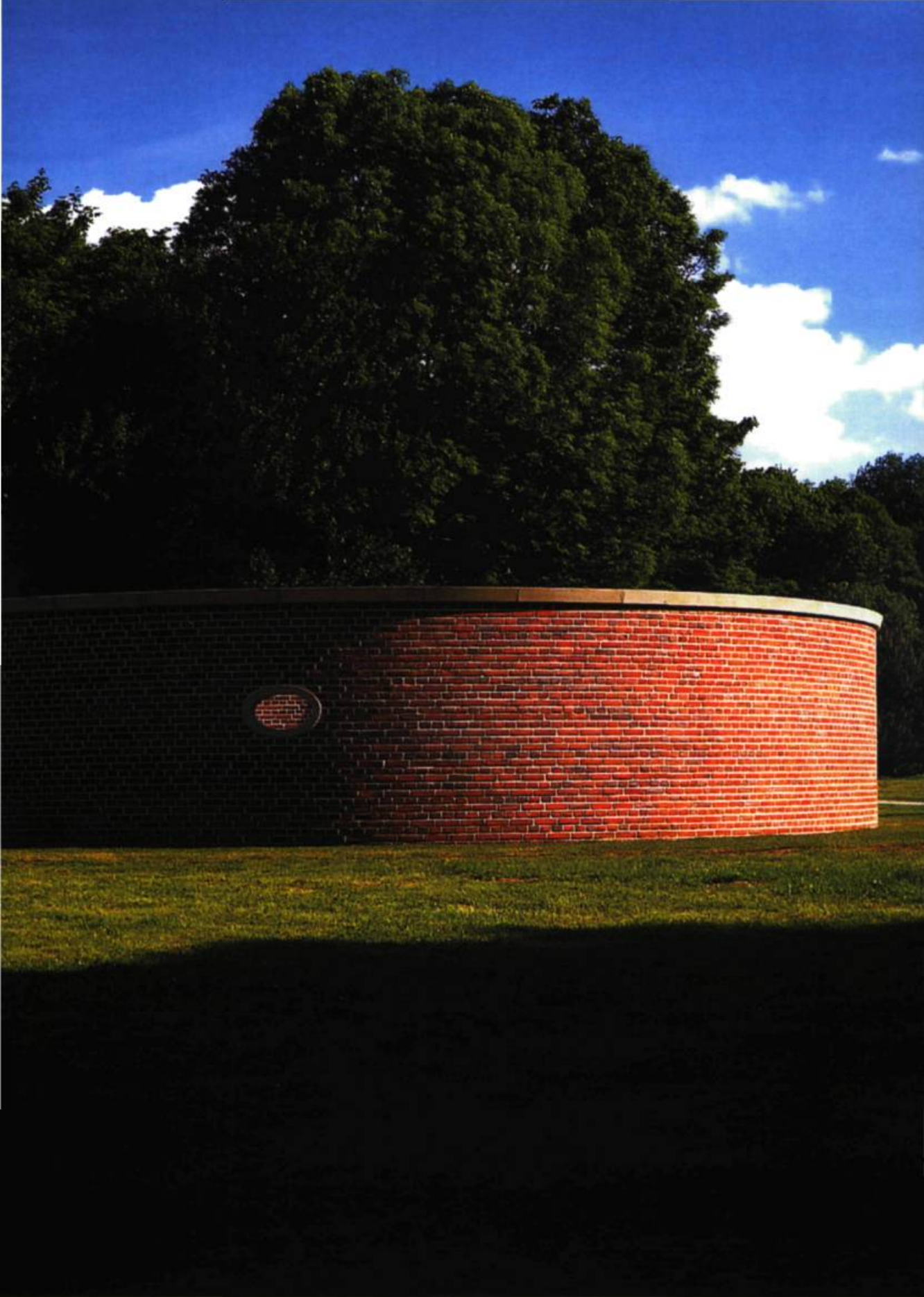
Herman de Vries, Sanctuarium . Muenster, 1997.