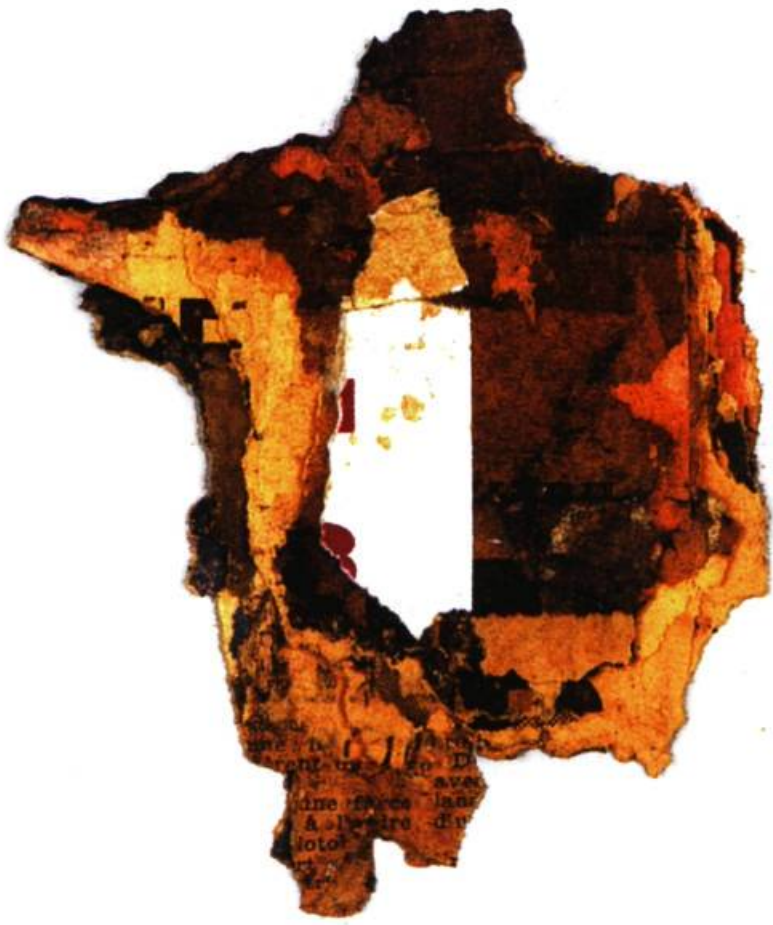
Herman de Vries, What is rubbish? Found collage .