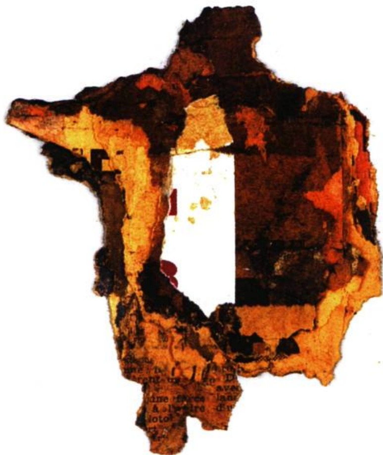
Herman de Vries, What is rubbish? Found collage.