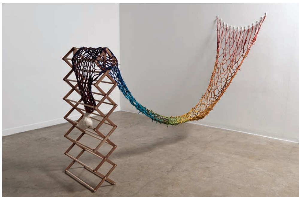
Beth Stuart, Stanchions for E.H./Thingdu , 2012. Spranged handcut leather, maple, walnut, unique porcelain vessel, unique glazed porcelain hooks.