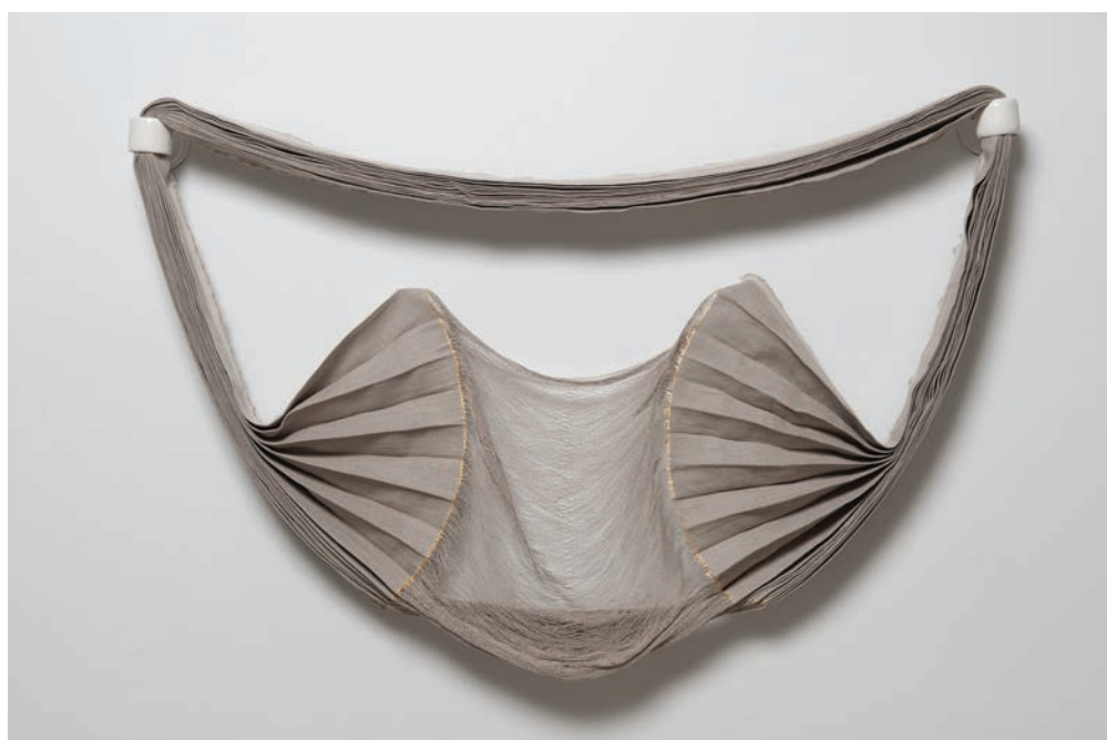
Beth Stuart, But a weak smile , 2012. Commercial artist's linen (weft partially removed, warp spranged, remainder pleated), gesso, gold leaf, unique glazed porcelain stanchion hardware, image courtesy the artist, photography: Paul Litherland.