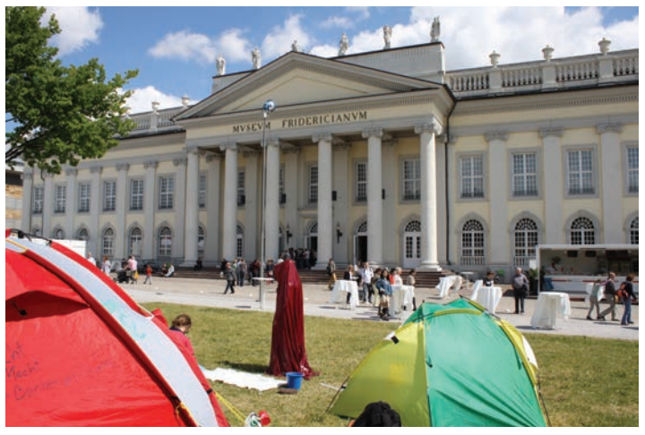
Occupy Documenta outside Friedrichsplatz, 2012.