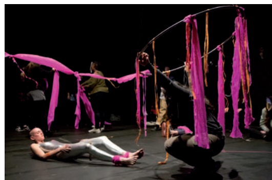
Sonia Boyce We move in her way, 2017.