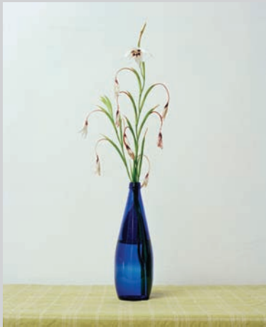
Blue Bottle , 2011, inkjet print, 101,6 x 81,3 cm