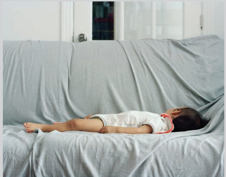
Shaore Lies on Futon , 2011, inkjet print, 101,6 x 127 cm

— James D. Campbell is a writer on art and independent curator based in Montreal. The author of over 100 books and catalogues on contemporary art and artists, he contributes frequently to visual arts publications across Canada and abroad. —