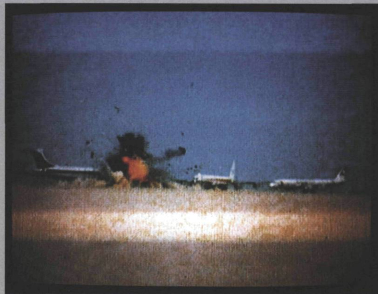
Johan Grimonperez, image tirée de DIAL H-I-S-T-O-R-Y , 1997. Avec la permission du Netherlands Media Art Institute.

Elitza Dulguerova est post-doctorante à Stanford University. Son livre Usages et utopies: l'exposition dans l'avant-garde russe préévolutionnaire paraîtra en 2009 aux Presses du réel.