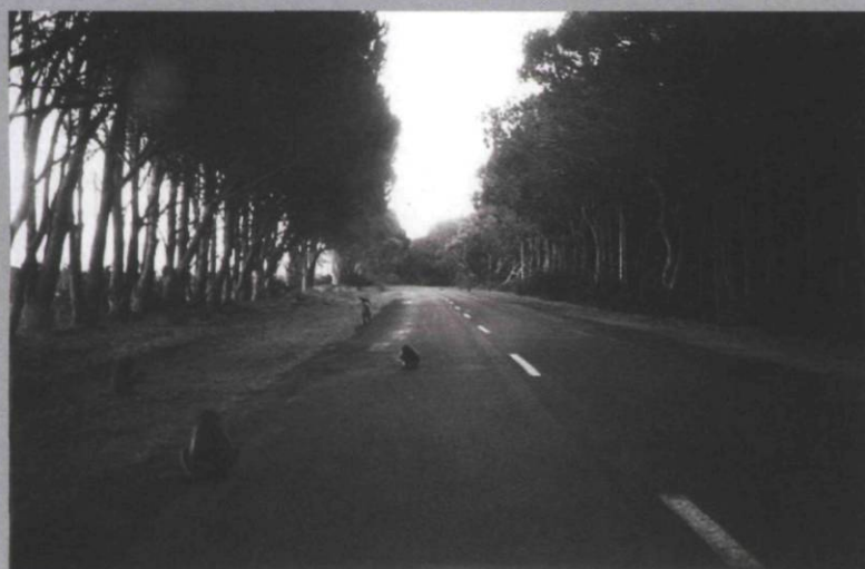
Wolfgang Tillmans, Tiere, 2005, C print, 144,8 x 213,4 cm

55th Carnegie International Pittsburgh, Pennsylvania, May 3, 2008–January 11, 2009